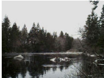
West River Water Front