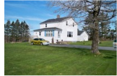
Great Ocean Views