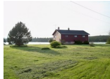
Pristine Ocean Front