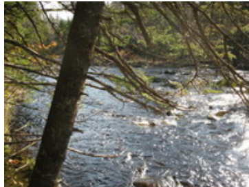
Back to Nature