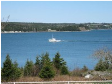
"TIME TO SLOW DOWN"