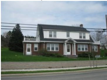
Stately Brick Home