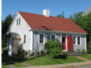
"Wattle & Daub"