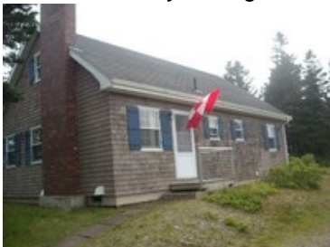
The Crilley Cottage