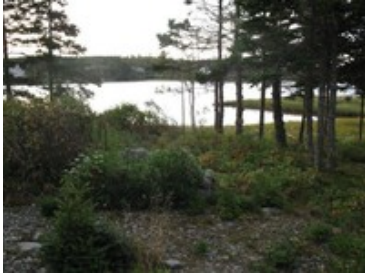
Light House View