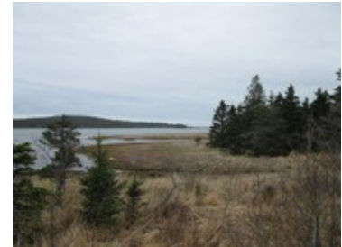
Petpeswick Inlet Waterfront