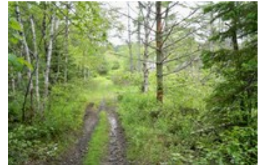
Sheet Harbour - Building Lot