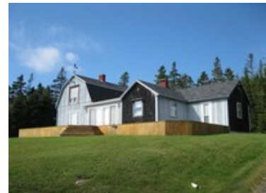
A Real Gem