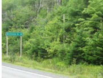
Among the Birches