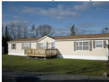
"Wild Berry Hideaway"