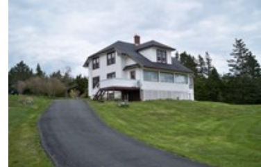
A Delightful Surprise Awaits